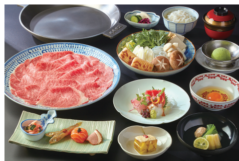
Asakusa Imahan Special Lunch Gozen