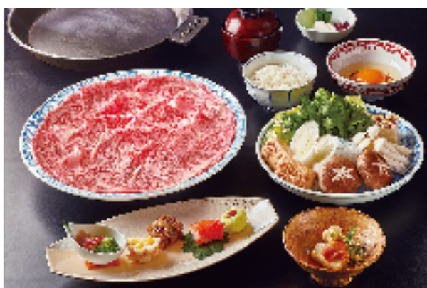
Finest Marbled Beef Sukiyaki Gozen

◆ Extra Finest Beef Fillet Sukiyaki or Shabu shabu Gozen ..... ¥17,600 Appetizer, Extra Finest Beef Fillet Sukiyaki or Shabu-shabu (Meat 130g), Meal set, Dessert