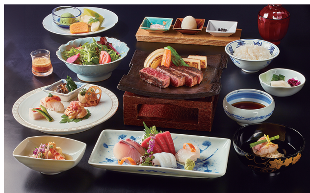
Kobe Beef Sirloin Steak Kaiseki

※These prices include tax(10%). ※Service charge (10%) will be added to your total bill. (In the case of more than 5,500yen per person.)