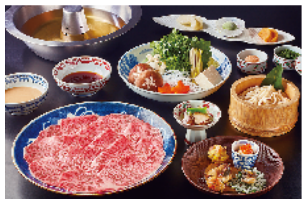
Selected Brand Beef Shabu shabu Gozen